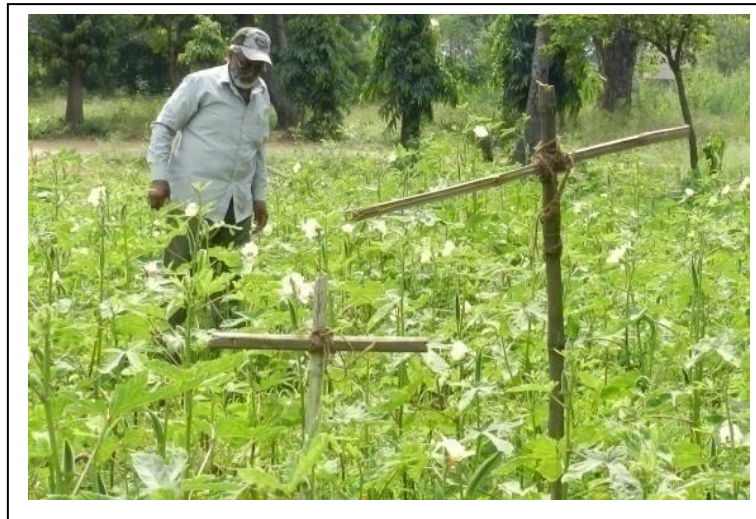
T perches installed in Bhendi field