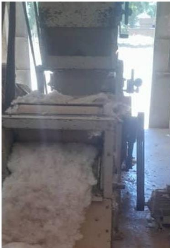
Figure 2: Gin continental 20-saw.

formulations. The 20-saw continental-type ginner for ginning samples, the hygrometer for moisture control and the chronometer for measuring ginning speed, the USTER HVI 1000 high-capacity measuring chain with fibre passage through the 'System Testing' consisting of three modules (the micronaire module, the colorimetry module and the length module), compartments that made it possible to determine: fibre length, uniformity, tenacity, elongation, micronaire index, fibre maturity, fineness, reflectance and yellow index in accordance with standards, under controlled temperature and humidity conditions ( 21 \pm 1 °C, humidit  relative 65 \pm 2 %). Trolleys for fibre conditioning.