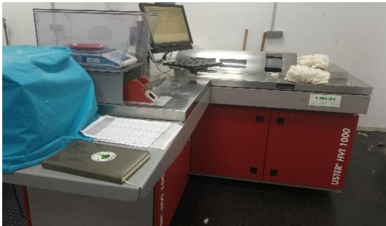
Figure 5: Integrated measuring chain Model 1000/1000