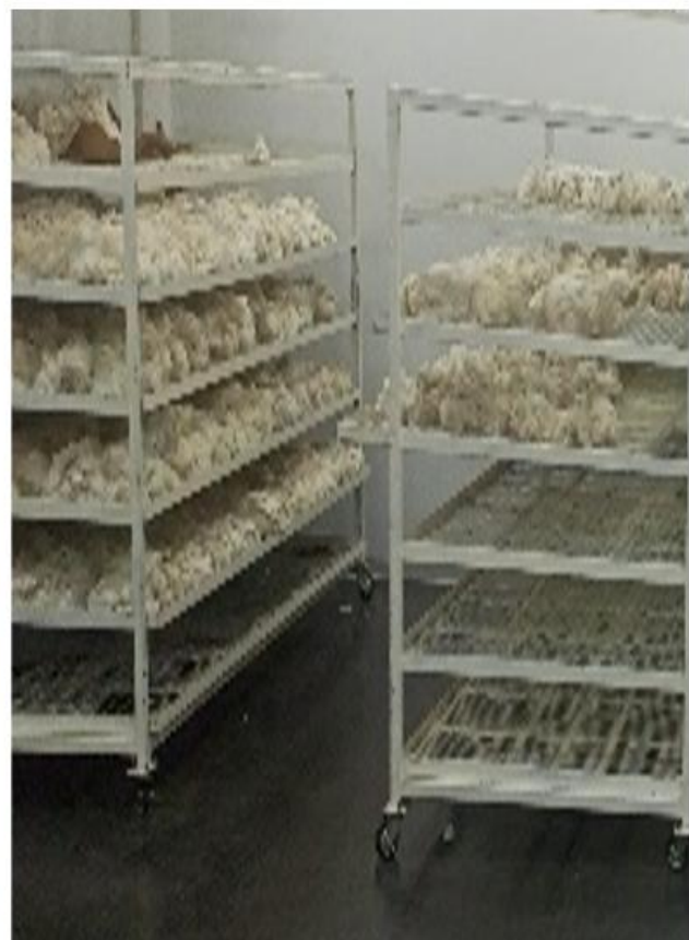
Figure 3: Sample packaging