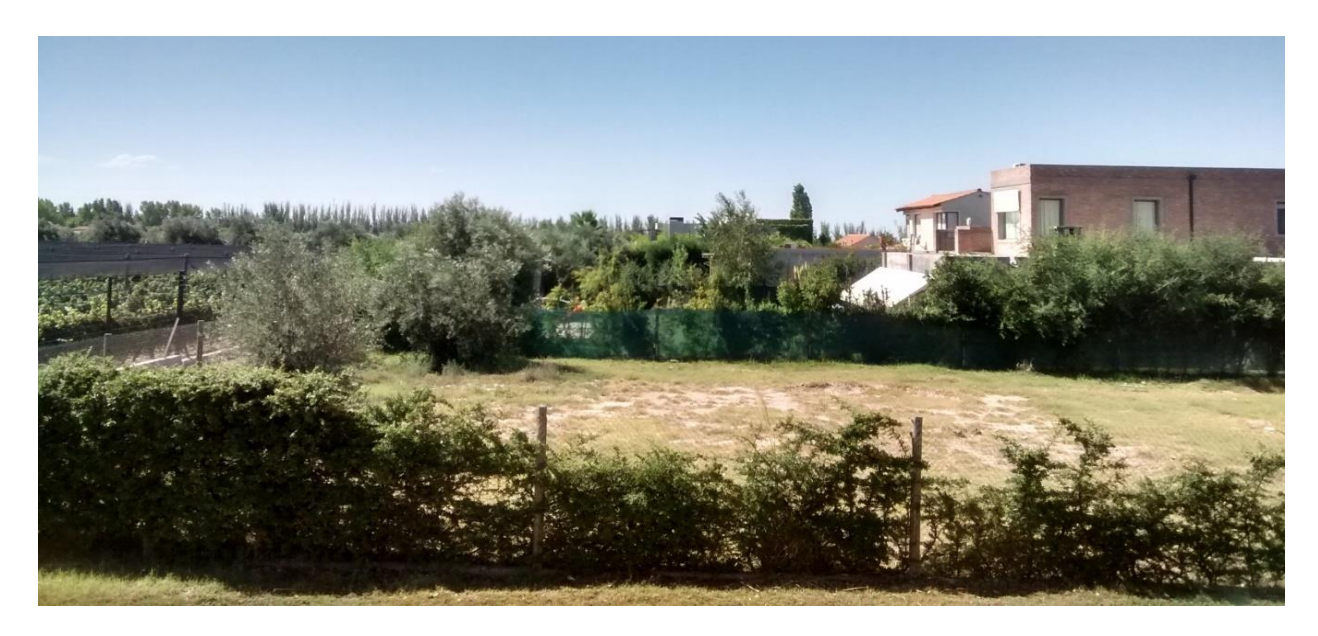
Photo 3: Private condominium Aráoz. Araoz Street in the department of Lujan de Cuyo.

The characteristics and main elements of this period are that live primarily features of previous periods with the introduction of private neighborhoods between vineyards. In addition to the presence of old wineries, as new types of wineries built in old soils for cultivation.