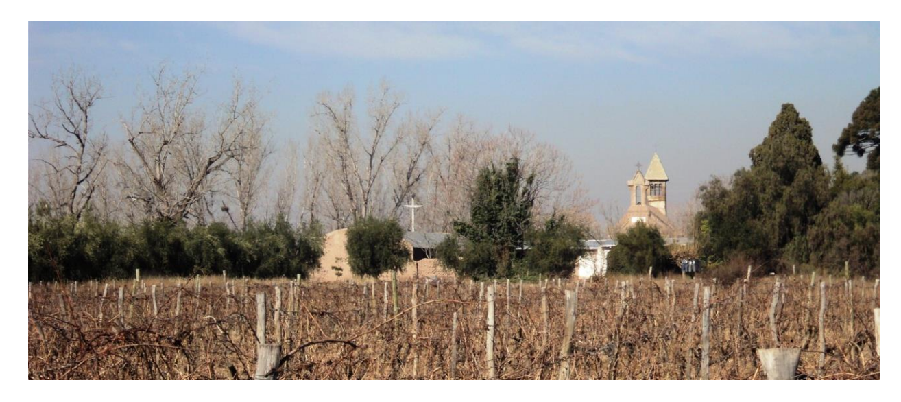
Photo 1: Winery and Vineyards Panquehua in Las Heras.

In this wine period it saw the transition from the nineteenth-century miller wine rancher capitalist production model. The main features and elements that are found in the landscape are primarily agricultural area that is not only wine. As (Cirvini and Manzini, 2011) argues we can find there the testimonies of various productive activities that took place while the wine, as forage production, mills, cattle. The agricultural space is structured around the former functions of the hacienda, not around the wineries. Wine production occupies a complementary role. The whole farm is organized as an introverted way around a central space. Senior elements are the family house and the oratory. The wineries are simple buildings, non-hierarchical, or its location, style and scale. The heart of the property is separated from traffic lanes, surrounded by crops. On the central area of the farm, there is a convergence of the roads that structure the property and link the various buildings where productive activities were developed.