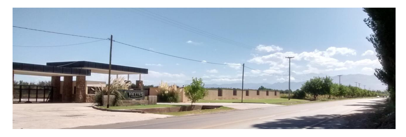
Photo 4: Private condominium Front Vieytes Route 60 in the department of Maipú.